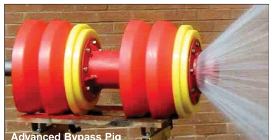
Advanced Bypass Pig