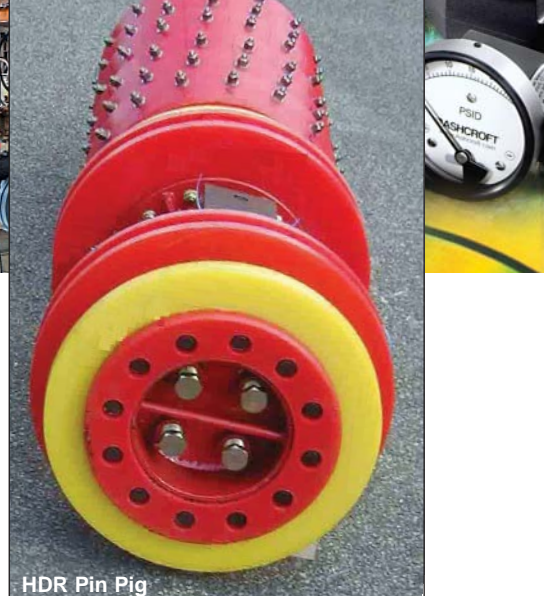
HDR Pin Pig

For previously unpigged pipelines or pipelines where large quantities of debris are expected, we have developed our Advanced By-Pass Pigs which are fitted with a number of internal pressure relief